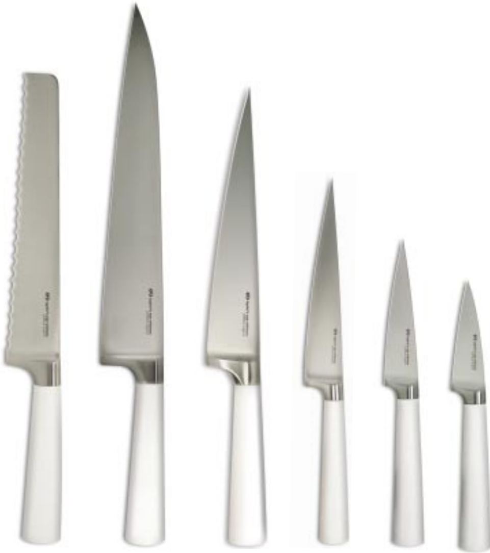
BREAD KNIFE (19cm / 7½" Blade) IF4006